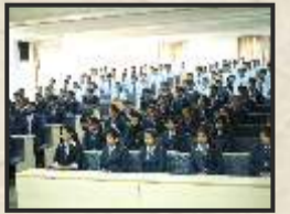
Seminar Hall and Auditorium